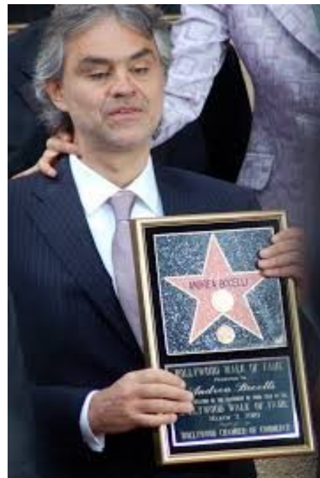
"My Christmas" trophie